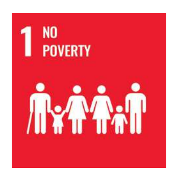
SDG 1: NO POVERTY Mapped with principles: P3, P4, P8